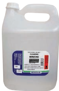
BENZINE CLEANING SOLVENT 5000ML MEDICOLA PRODUCT CODE: 36514