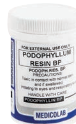
PODOPHYLIN RESIN 25G POWDER MEDICOLAB PRODUCT CODE: 56710