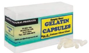
EMPTY GELATINE CAPS 150 SIZE 0 A WHITE PRODUCT CODE: 81820