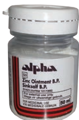
ALPHA ZINC OINTMENT 50ML PRODUCT CODE: 63483