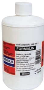
FORMALIN 40% SOLUTION 500ML MEDICOLAB PRODUCT CODE: 7084