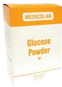
GLUCOSE POWDER 500G MEDICOLAB PRODUCT CODE: 7432