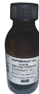
PEPPERMINT OIL 100ML MEDICOLAB PRODUCT CODE: 87365