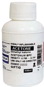
ACETONE SOLUTION 100ML MEDICOLAB PRODUCT CODE: 2742