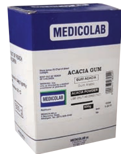
ACACIA GUM 500G POWDER MEDICOLAB PRODUCT CODE: 35871