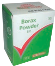
MEDIRITE BORAX PWD 50GM PRODUCT CODE: 73448