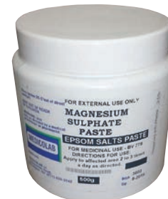
MAGNESIUM SULPHATE PASTE 500G MEDICOLAB PRODUCT CODE: 28396