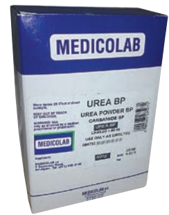
UREA BP CRYSTALS 500G MEDICOLAB PRODUCT CODE: 84649