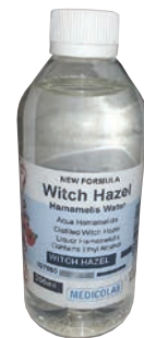
WITCH HAZEL 200ML MEDICOLAB PRODUCT CODE: 27990