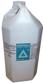
BRUMALT 2500ML SYRUP PRODUCT CODE: 4310