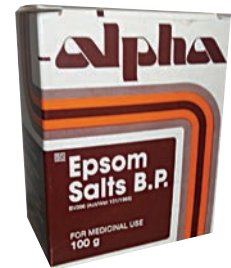
ALPHA EPSOM SALTS 100G PRODUCT CODE: 63395