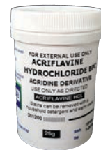
ACRIFLAVINE POWDER 25G MEDICOLAB PRODUCT CODE: 35881