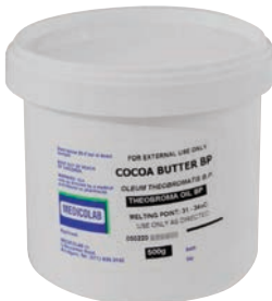
COCOA BUTTER 500G MEDICOLAB PRODUCT CODE: 85518