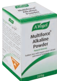
MULTIFORCE BASE PWD 225G PRODUCT CODE: 40371