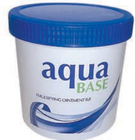
AQUA-BASE EMULSIFYING 700ML OINTMENT PRODUCT CODE: 64250