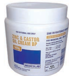
ZINC & CASTOR OIL 500G CREAM MEDICOLAB PRODUCT CODE: 58200