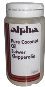
ALPHA COCONUT OIL 100ML PRODUCT CODE: 63388