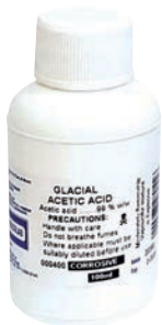
ACETIC ACID GLACIAL 99% 100ML MEDICOLAB PRODUCT CODE: 35872