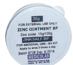
ZINC OXIDE OINTMENT 30G MEDICOLAB PRODUCT CODE: 46412