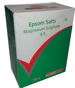
EPSOM SALT MEDIRITE 500G PRODUCT CODE: 73459