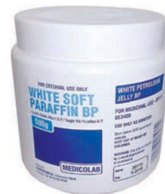
PARAFFIN SOFT WHITE 500G MEDICOLAB PRODUCT CODE: 44823