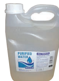
PURIFIED WATER 2000ML MEDICOLAB PRODUCT CODE: 11362