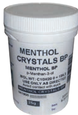
MENTHOL CRYSTALS 25G MEDICOLAB PRODUCT CODE: 37633