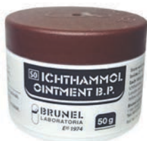
UNG ICHTHAMMOL 50G BRUNEL PRODUCT CODE: 61461