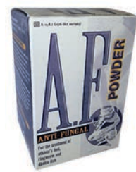
AF POWDER 75G PRODUCT CODE: 2966