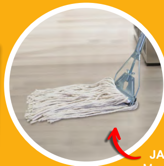
JA0203 Mop Head Refill