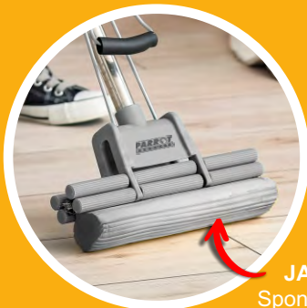
JA0302 Sponge Refill