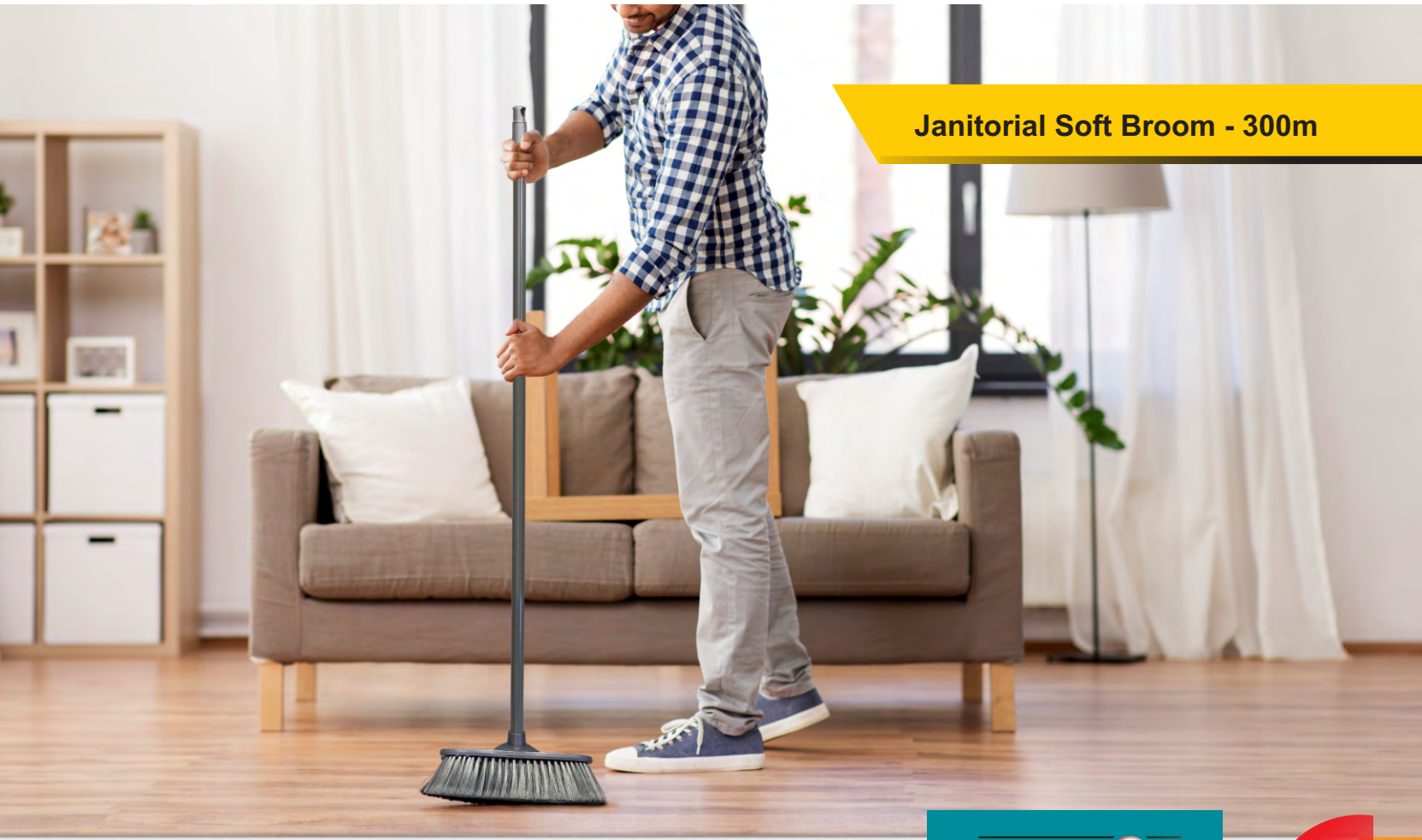
Janitorial Soft Broom - 300m