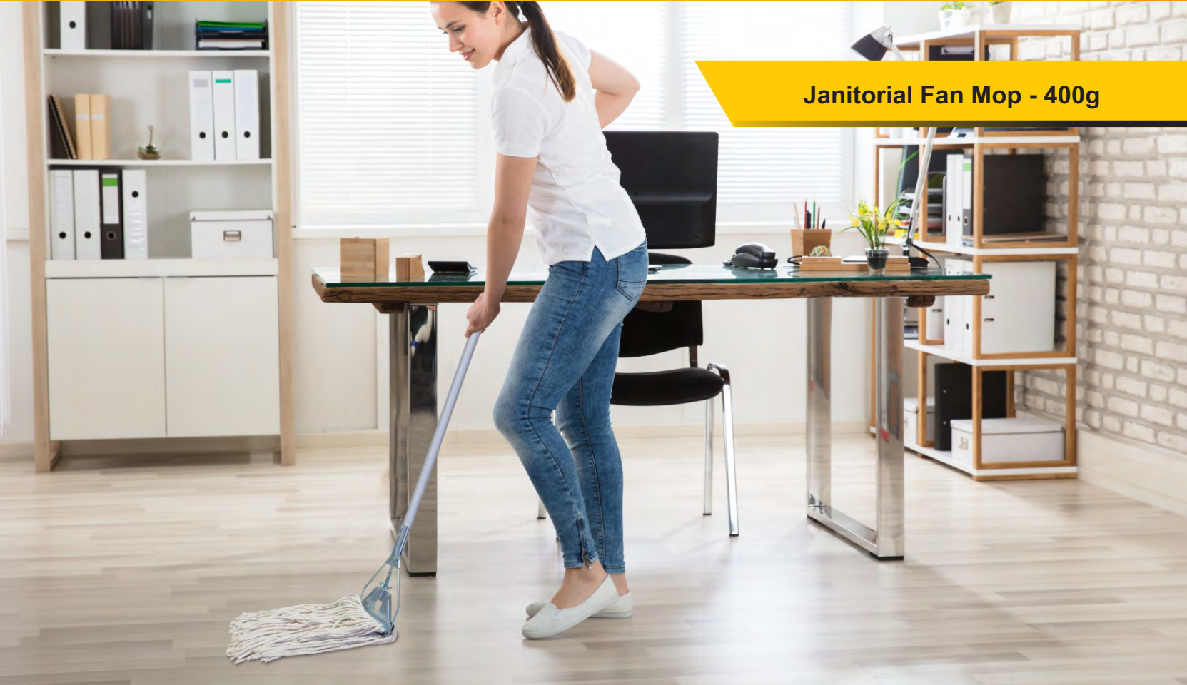
Janitorial Fan Mop - 400g